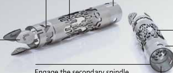
Stainless tubular implant with ID increase & OD reduction. Laser cut precision patterned with cross hole drilling.