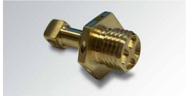
Brass rod precision CNC machined.

speaking we are targeting 24 inches maximum. Unique CNC machined features will require purchase of dedicated tooling. ID work as well as OD work will be capable of being done on both ends of the tube/rod component.