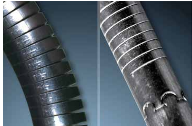
Laser cut flex patterns with other attachment forms for laser welded assemblies.