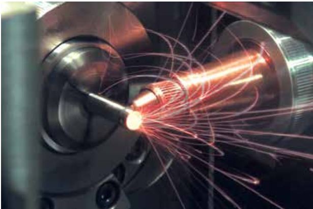
Combine CNC Laser Cutting and...

We've seen cases in which the LaserSwiss is FIVE times more productive than the current approach. Naturally every situation is different, but productivity by eliminating multiple setups and deburring operations is our goal.