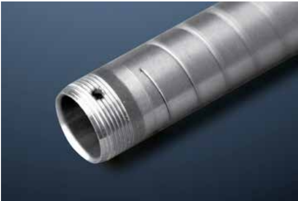
Creating these part features requires threading, chamfering, and laser cutting, all of which were accomplished in under fifteen seconds.

It all adds up to higher quality product with better manufacturing value. Provide a design for a free manufacturing estimate.